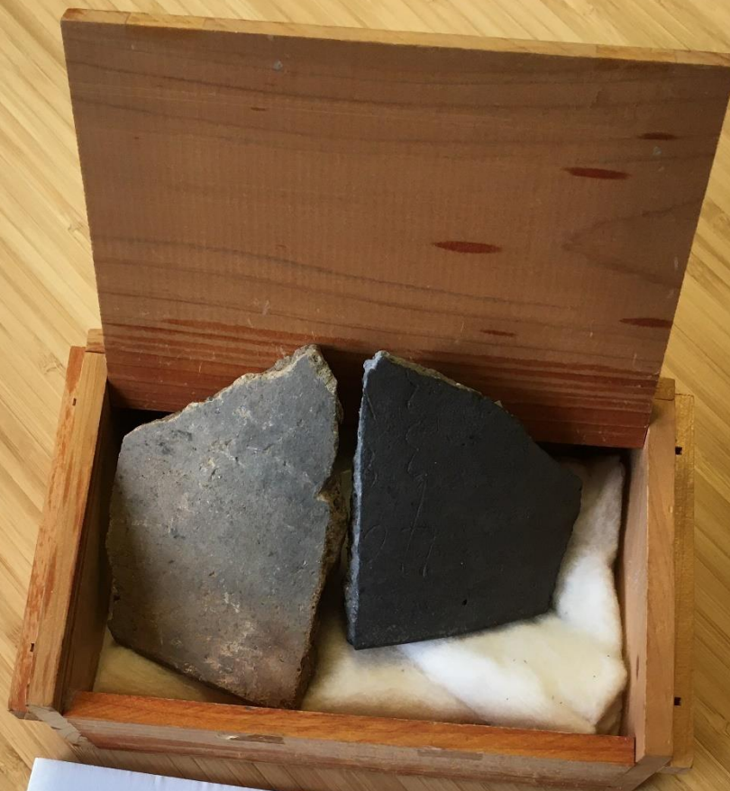
Damaged Roof Tile from Hiroshima (Left) Undamaged Roof Tile from Hiroshima (Right) Traditional Japanese Clay Kawara Roof Tiles

The tile on the left was burned, charred, and destroyed in the bombing of Hiroshima; it was approximately 1/3 mile from Ground Zero. At detonation, the estimated heat from the atomic blast was between 7,000°-9,000° F. The heat that damaged this tile reached about 1800° F, and it would have taken approximately 3 seconds for this damage to occur. The tile on the right is the same roof tile but undamaged.