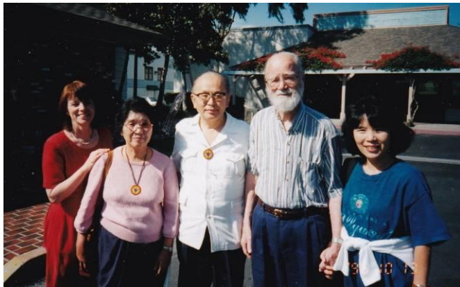
1996 American PAX