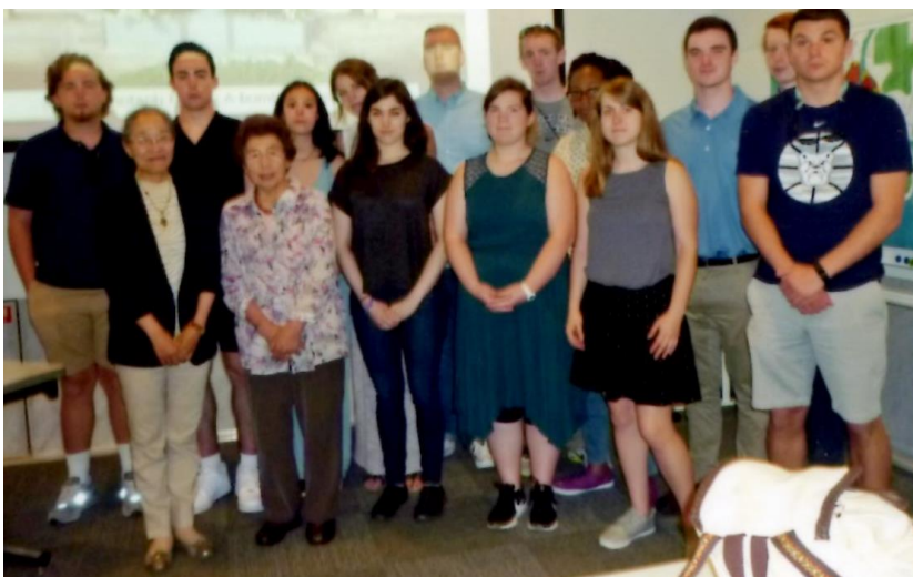
Butler University, Indianapolis May 31, 2016