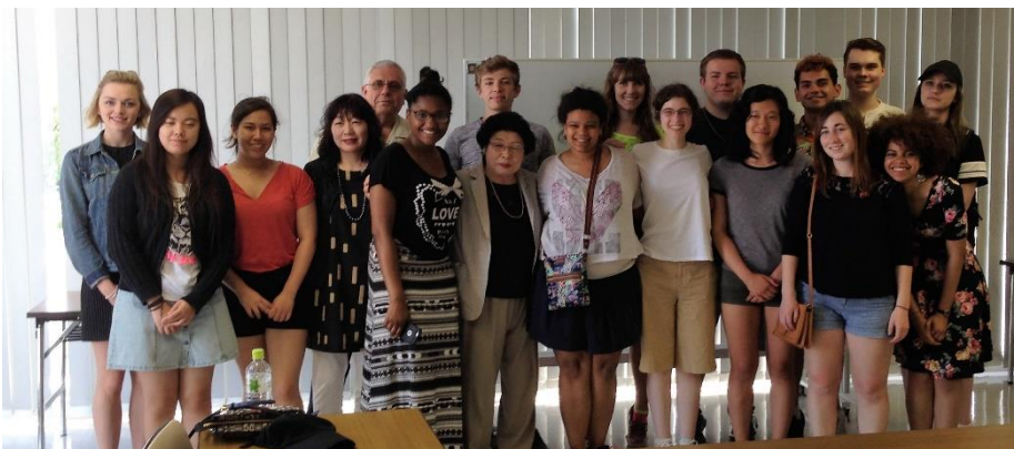
University of Michigan May 19, 2016

Outside visitors, usually in groups, have begun more and more to request our Hibakusha talks and Peace Park tours. Because the outside groups do not stay overnight at WFC, they make a contribution to WFC. We had 3 people in March and 13 people in April request these services. In May, we had a group of 16 from Butler University and in June, we will have a group of 21 from Envoys, a company that specializes in global education programs.