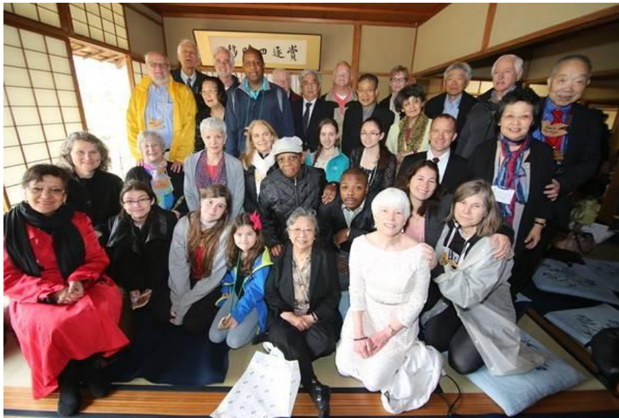
WFC 50 th Anniversary Ceremony at Seifukan in Shukkeien Garden

The experience of Hiroshima and Nagasaki was not well utilized, it seems. It is a pity. We were easily misled by the disguising adjective, “peaceful” use of nuclear energy. It was a kind of logical trap into which we all fell. At middle schools in Japan for some decades, textbooks for physics did not deal with “nuclear energy” nor “radioactivity” at all, so after the big Tohoku Earthquake in 2011, teachers in Fukushima did not know how to deal with the subject. They had to learn in that summer in a special course organized by the Ministry of Education on the theme. To create organic junctions to different social phenomena and levels of various fields of knowledge seems to become more and more important in modern times. This may be a big assignment for quality journalism. Those were my thought on the rainy hours of the day. Again, those people, supporters at the WFC are all so enthusiastic, full of heat, singing, eating, dancing, acting, playing, abundant in thoughts, educating and building for a better world. We should be optimistic with hope, at the WFC we always find a source of ever-lasting energy for friendship. That perception makes us feel warm at heart.