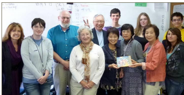
Monte Del Sol Charter School (Albuquerque)