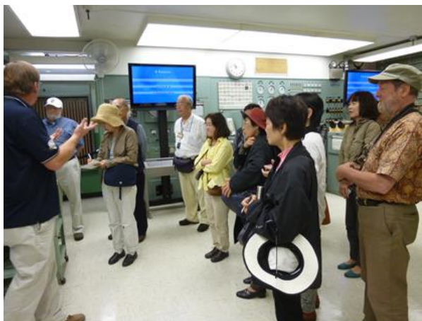
(Hanford B Reactor in Washington)