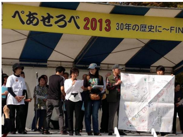
Peace Choir on stage at Pe-A-Ce-Lo-Ve