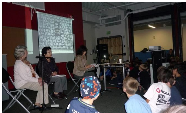
(Willamette University in Salem ,Oregon)