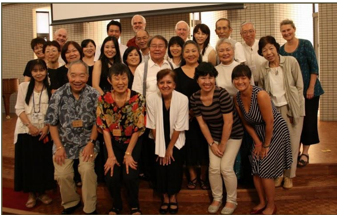
(After One World Peace Concert at Nagarekawa Church)

Please stay in touch. Even though I am a tardy correspondent, it is because I am working hard to rejoin you.