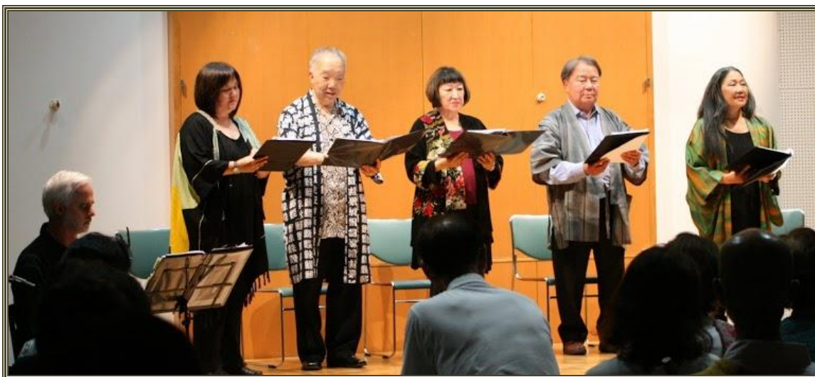
(Breaking the Silence Performance at Hiroshima International House on August 3 rd )

In America, we have a saying: "out of sight, out of mind." But this is certainly not true of me. WFC and my time in Hiroshima are never far from my mind. I have felt ever since I left Hiroshima that the educational opportunities BTS and WFC created must continue. PAX's visit to New Mexico has strengthened my belief that we must have a cultural and educational exchange that is global, and I am working toward that goal.