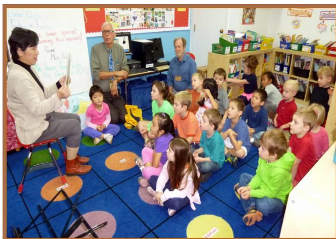
Michiko Hamai Touchstone Kindergarten (Portland)

To be improved: 16 participants were too many to arrange transportation, lodging, and consensus building. The appropriate number of participants should be 5 to 6. I promise to welcome the many people who took care of us so very kindly while we were in the USA, and the US PAX members coming to Japan in 2 years.