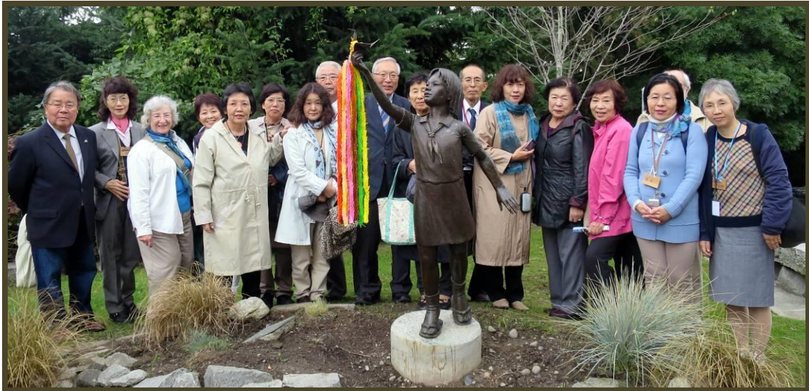
(Sadako Monument at Peace Park in Seattle)