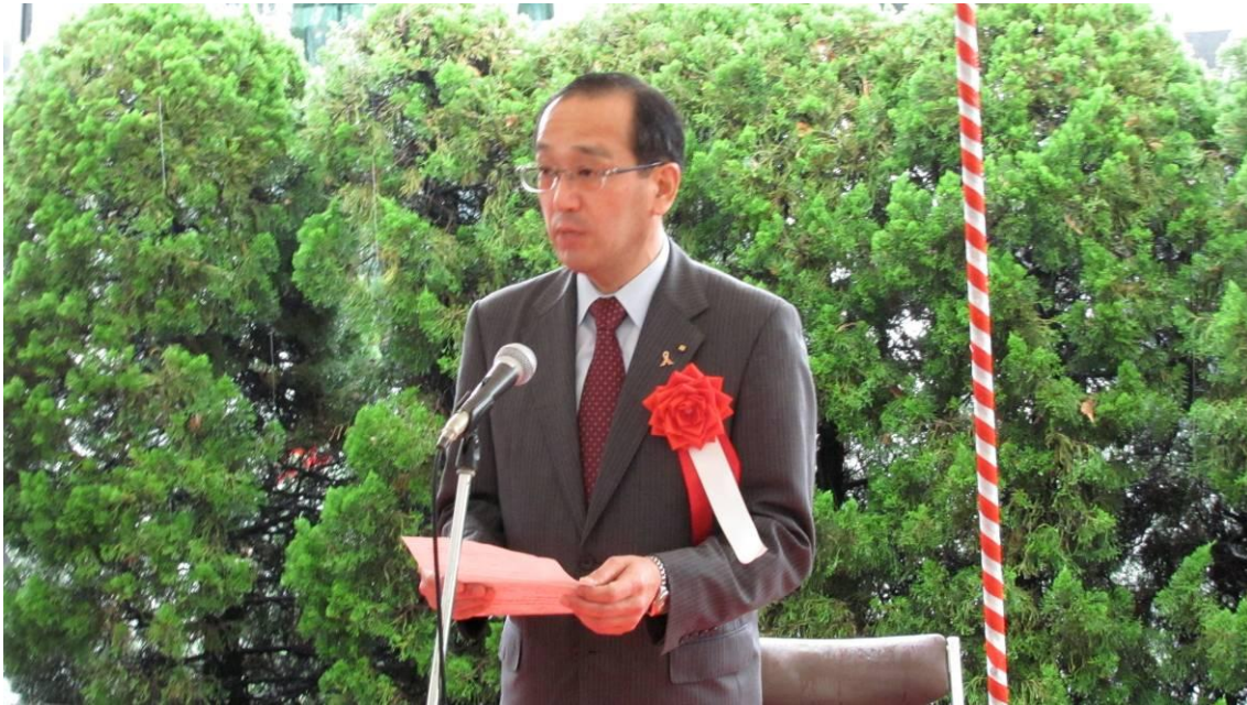
Current Mayor of Hiroshima, Mr. Matsui