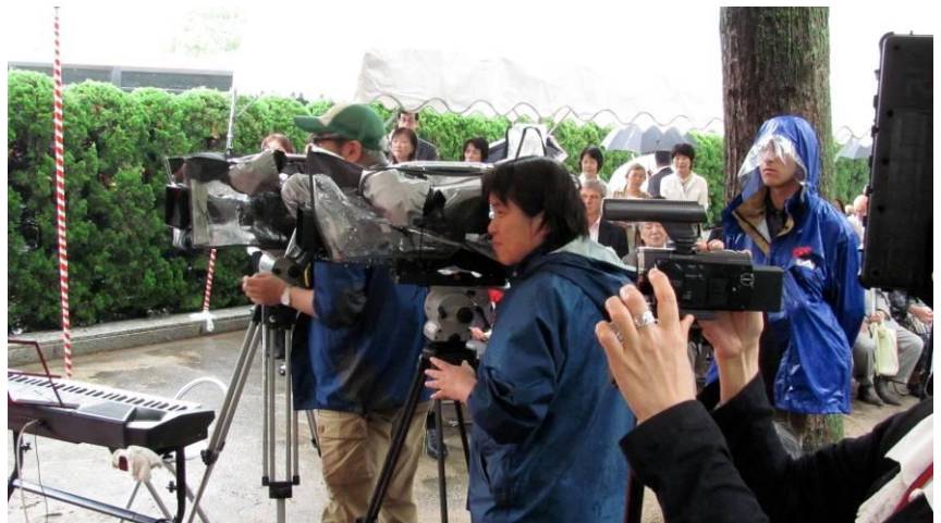
Many representatives from the media attended and were well protected from the heavy rain.