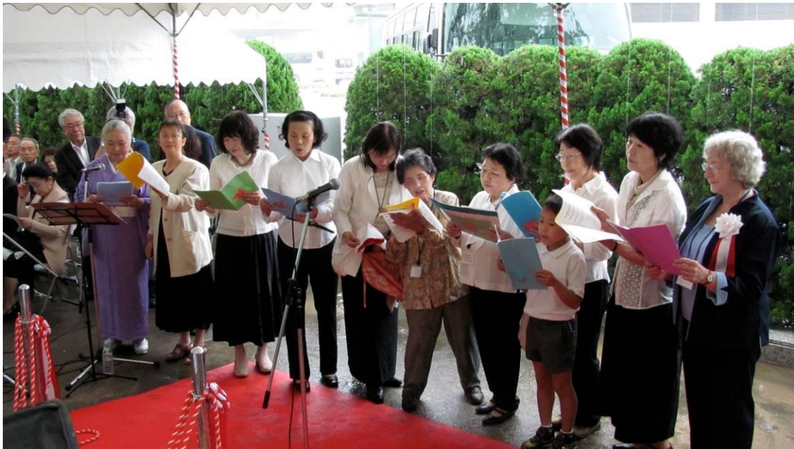
The World Friendship choir shares special music.