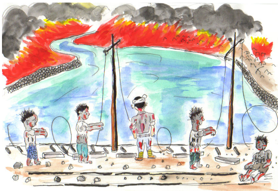
At MIYUKI Bridge

Then I remembered a piece of simple information about an atomic bomb that I had once read in a magazine for boys a couple of years before that day. The article had said something like ———a small bomb of a match-box size could destroy even a mammoth battleship some day in the future, and its material was from atomic energy. So I understood that the U.S. invented an atomic bomb, and I thought it was very hard for us to win the war. However, even if I had some knowledge then, it did not make any sense.